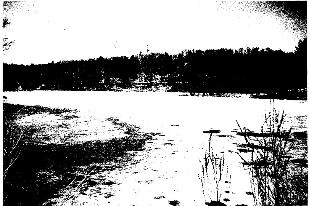
The Fourth Binnewater Lake as viewed from Binnewater Road, Rosendale