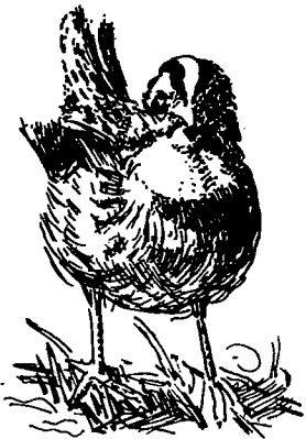
Drawing By Ilka List