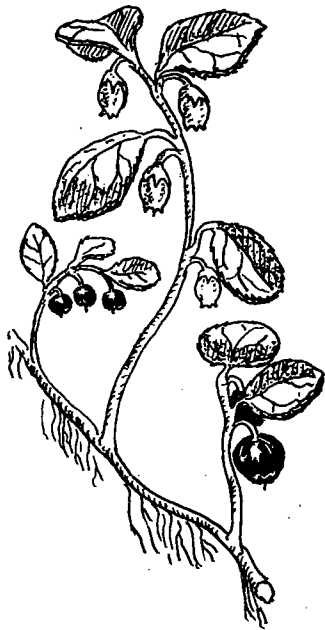
Drawing By Ilka List