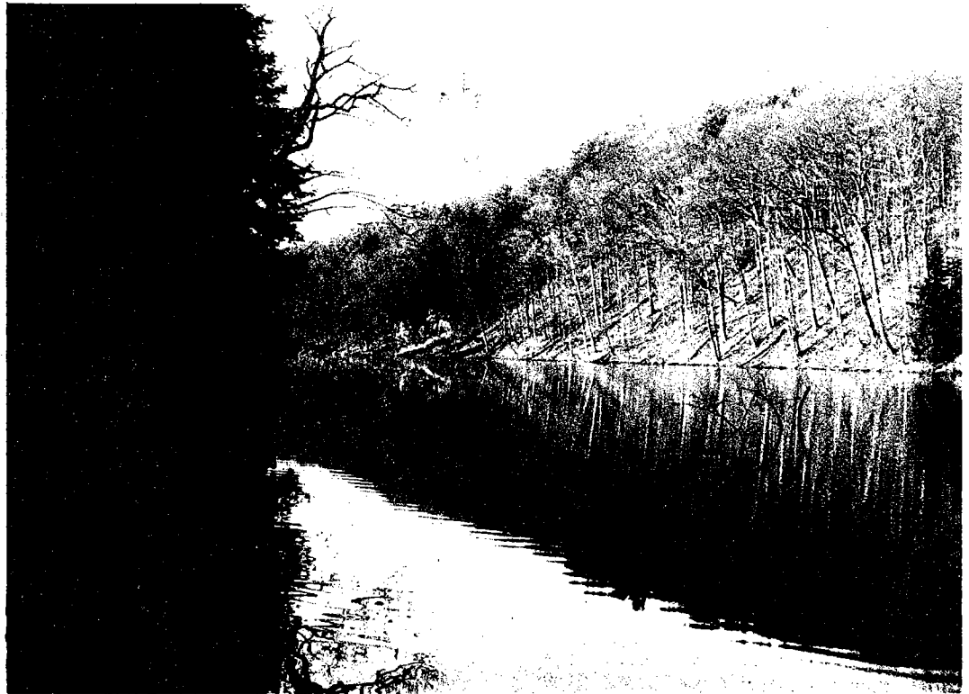
Esopus Gorge Easement Site