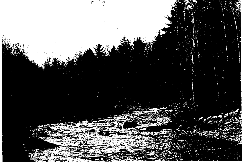
A Crucial Olive Location